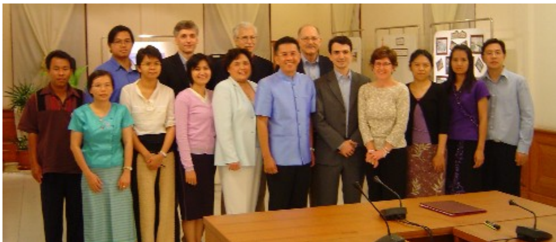
Group photo of Oregon, Washington city administrators visiting Thailand.