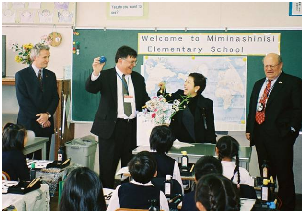
Presentation to a calligraphy class at the Miminashinisi Elementary School in Nara, Japan.