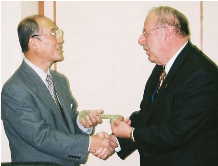
The Mayor of Nara Japan presents the City key to the Mayor of White Plains, New York.

The Illinois International Exchange Program is administered by an Ad Hoc Committee comprised of three to five ILCMA members. The President of ILCMA selects the Chairman, who in turn is responsible for recruiting the remaining Committee members. The Committee reviews the applications, which includes a proposal for funding and all of the application material submitted to the ICMA Exchange Program. The Program is funded through the annual dues paid to the Association by the members.